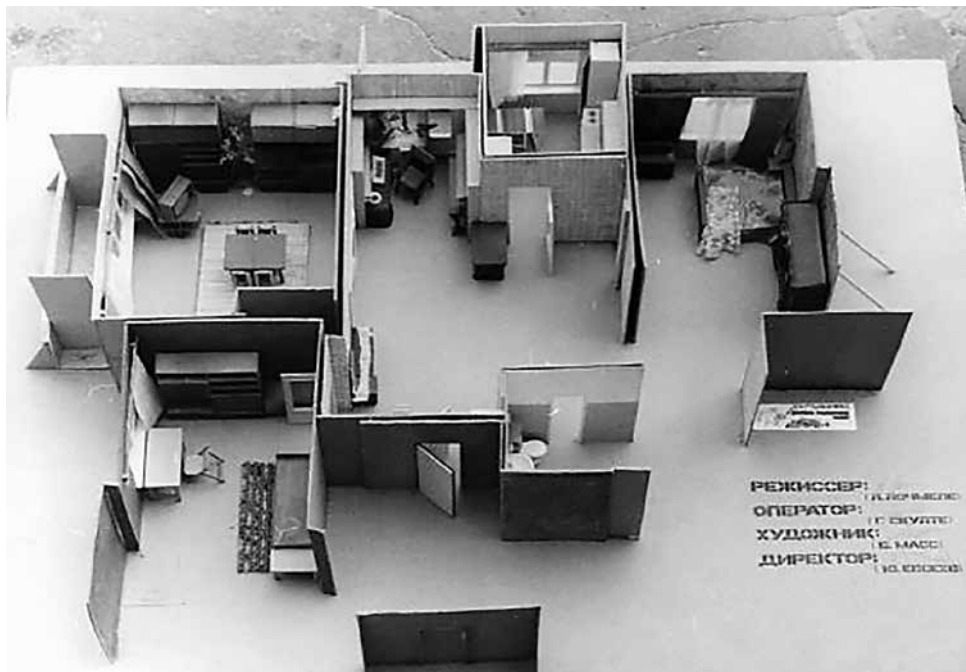
Figure 4. Model of interior for the movie Laika prognoze augustam [Image: Riga Film Museum Archive].

Between the early 1970s and mid-1980s, lack of apartments was gradually decreased, however, there was an increasing concern about the quality of living (fig. 4). Depiction of living space in mikrorajoni was increased. Besides interior, movies also represent interrelated and complex groups of spaces in these neighbourhoods: courtyards, playgrounds and parks, that supplement portrayal of home-room ( Dāvanas pa telefonu , A. Brenčs, 1977). Moreover, it is possible to compare the interior in Soviet movies with French philosopher Michel Foucault’s social theory of panopticon, where the main character acts as a watchman, who rationally observes the external space ( Laika prognoze augustam , L. Ločmele, 1983; Pēdējā indulgence , A. Neretniece, 1985). However, at the end of this period, residents in interiors of mikrorajoni are depicted dissatisfied. It is related to several flaws in the living space, such as narrowness of rooms, uniformity of the space and the poor quality of construction materials ( Novēli man lidojumam nelabvēlīgu laiku , V. Brasla, 1980).