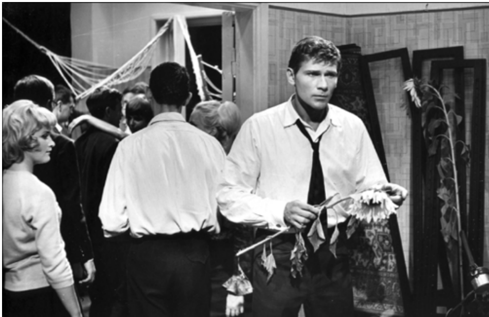
Figure 3. Housewarming party in the movie Četri balti krekli [Image: Riga Film Museum Archive].

From the mid-1960s the focus was set on the continuous expansion of prior enterprises in order to reduce deficiency of commodities and services. Accordingly, these conditions advanced construction of residential houses. Living space of mikrorajoni is portrayed in four movies ( Četri balti krekli , R. Kalniņš, 1967; Meldru mežs , E. Lācis, 1971). However, due to limited information about filming location and fragmented depiction of these spaces, it is impossible to determine exact districts in Riga, where the interiors were recorded. The current study found that mikrorajoni already make an integral part of the city, where courtyards and front entrance to the living space becomes a space of social conflict. Moreover, movies illustrate new sociocultural tradition – housewarming party or sālsmaize (fig. 3). Housewarming is an important component in representing living space of mikrorajoni , and it plays a key role in a mutual communication in the Soviet period. Apartments of mikrorajoni are represented as something desired for a long time. For example, the main character