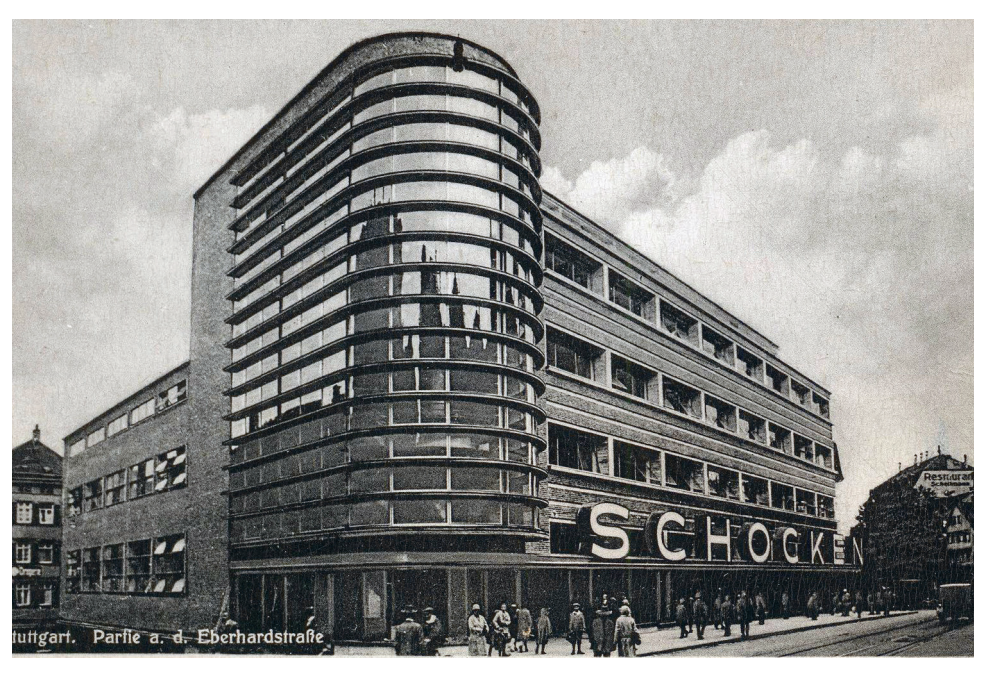
Figure 2. Erich Mendelsohn. Schocken Department Store in Stuttgart. 1926–1928. Postcard, 1930. From: <a href="http://www.ansichtskarten-markt.com/de/kategorie-1/grossstaedte/stuttgart/ak-foto-stuttgart-partie-eberhardstrasse-kaufhaus-schocken-1930-rar">http://www.ansichtskarten-markt.com/de/kategorie-1/grossstaedte/stuttgart/ak-foto-stuttgart-partie-eberhardstrasse-kaufhaus-schocken-1930-rar</a>

Influences from Mendelsohn remained persuasive later too. Reconstruction design of Hotel de Rome in Riga was worked out in summer 1930. Štālbergs here proposed a bold solution, breaking the uniform rhythm of the 19<sup>th</sup> century neo-renaissance façade with a remarkably modernist element – a narrow, vertical, fully glassed semicircular bay window (Figure 3). A similar principle was used for the reconstruction of the newspaper Berliner Tageblatt administrative building in Berlin by Erich Mendelsohn and his assistant Richard Neutra in 1921–1923. They put a new, contrasting modernist structure on the historicist Art Nouveau building, creating a streamlined corner [Krohn, Stavagna 2022: 58]. Štālbergs turned the 19<sup>th</sup> century historicist building into a shell for the modern content and lifestyle, manifested by the sharply contrasting glass split on the façade. The architect's clear shift towards modernism is seen in the concept of reconstruction, aimed at a deliberate contrast between the new structure and the historical architecture. The striking difference between the old and the new emerges as a surprisingly progressive idea in Latvia's architectural milieu of the time.