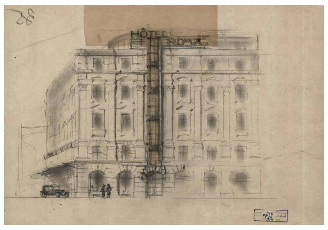
Figure 3. Ernests Štālbergs. Hotel de Rome reconstruction design. 1930. Perspectival view from Aspazijas Boulevard. Latvian State Archive, coll. 95, reg. 1, file 233, p. 35.

In the early 1930s, the line of influence from Le Corbusier became stronger in Štālbergs' output, especially evident in his dwelling house designs, including architectural volumes as well as floor plans and interiors. Štālbergs examined and interpreted Le Corbusier's works to master the formal language of modernism. For example, in a sketch of an unknown mansion, Štālbergs tried the French architect's five principles of modernist architecture – the building had a flat roof, band-type windows on the façade but the ground floor was envisaged with a covered, postsupported gallery with large, shop-like windows, creating a visual impression of a volume resting on posts above the ground [Štālbergs ca. 1930-1931]. The sketch reveals influences from Le Corbusier's most typical works of the second half of the 1920s - semi-detached house at Weissenhof Estate (1926-1927) in Stuttgart and Villa Savoye (1928–1931) in Poissy. Štālbergs returned to this typical modernist façade composition in his 1934 competition design of Liepāja Latvian Society House – the main façade facing Rožu Square (Figure 4) is compositionally close to Le Corbusier's classic Villa Savoye. Direct impulses from Le Corbusier are also evident in the engineer Aleksandrs Siksna's house with its two-level, multi-functional