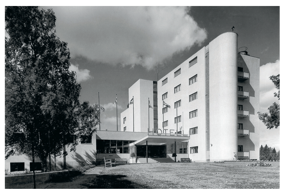
Figure 7. Märta Blomstedt, Matti Lampén. Hotel Aulanko in Hämeenlinna. 1936–1939. From: <a href="https://en.docomomo.fi/projects/hotel-aulanko/">https://en.docomomo.fi/projects/hotel-aulanko/</a> Photo: Pietinen / MFA.

The aforementioned examples demonstrate that consistent modernism and creative ambitions are better revealed in Štālbergs' unrealised designs or the so-called paper architecture. During construction the architect had to reckon with the commissioner's wishes as well as financial and technical resources, therefore modesty and compromises prevailed with dominant traditional architectural forms and greatly reduced functionalist details. While learning the functionalist language of forms, Štālbergs retained some critical attitude and tended to localise the style, creating an individual version. For example, he did not abandon sloping roofs or brick façades and also did not use the typical modernist white façades, choosing painted plastering or natural finish materials, like ceramic or wood cladding, instead. These aspects link his output to the architectural principles of Nordic countries. Štālbergs cared about the surrounding environmental context and regional traditions but differed from his Latvian colleagues, aiming to emphasise not national but regional traits, i. e., the Nordic identity, thus joining a broader cultural space.