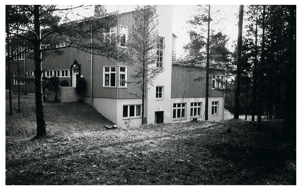
Figure 5. Ernests Štālbergs. Sanatorium Gaujaslīči . 1936–1939. View from the north.

A similar connection with nature is demonstrated in children's sanatorium Gaujaslīči whose architectural expression is based on the relief as well as on natural and modest finish materials (Figure 5). The building's façades are clad with vertical boards that create an aesthetic effect based on rhythmical lights and darks, also giving a modernist interpretation of the surrounding wooden cottages. However, one can widen the scope of analogies and influences, as such exterior finish was very common in exemplary houses at the Stockholm Exhibition, modernising the archetype of traditional Swedish farmstead. The sanatorium was possibly a synthesis of impulses from several such houses, evidenced not just by the vertical board cladding but also by the use of the single-pitched roof, close window proportions and rhythm. Similar examples were house no. 49 designed by Sven Markelius and house no. 47 by Sigurd Lewerentz. Štālbergs also took photos of simple, similarly boarded one-family houses during his visit to Sweden in 1934 [Štālbergs 1934]. The sanatorium complex was created, purposefully using the natural light, relief and pine forest conditions. The building conformed to the right-angle aesthetics but it was more adapted to human needs and emphasised naturalness, directly revealing the regional specificity of Northern European functionalism.