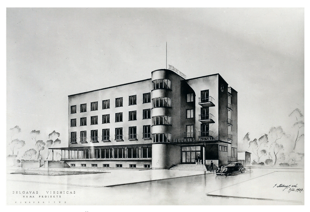
Figure 6. Ernests Štālbergs. Jelgava hotel design. 1937. Perspective. Photocopy. Latvian State Archive, coll. 95, reg. 1, file 153, p. 12.

Conversely, influences of Finnish functionalism are visible in Stalbergs' later work – the Jelgava hotel design created in 1937 (Figure 6). The building's accent is a narrow semicircular avant-corps that marks the entrance and the main staircase of the hotel. In the initial design version, the semicircular avant-corps emerges as a selfsufficient plastic form with one glassed side only. Such a solution is close to Hotel Aulanko (architects Märta Blomstedt, Matti Lampén, 1936–1939) in Hämeenlinna (Figure 7). However, the design also features the other line of influences as such semicircular avant-corps were commonly used by Mendelsohn's followers too. Impulses of Finnish architecture are also identifiable in the spatial solution of the Jelgava hotel restaurant hall, reminding of Restaurant Lasipalatsi (architects Niilo Kokko, Heimo Riihimäki and Viljo Revell, 1935) in Helsinki that has a similar floor plan and interior. Especially similar are the rhythm of posts and the glassed outer wall. It is known that Štālbergs visited Finland in 1935 [Štālbergs 1935]. The Jelgava hotel design shows how the tendency of representation and Nordic comfort entered Štālbergs' functionalist buildings in the second half of the 1930s. Modernist column shafts imitated marble but the stair railings were crafted of wood - more pleasant to touch and warmer than metal tubes [Štālbergs 1937]; wood was especially popularised by Alvar Aalto [McCarter 2014: 94].